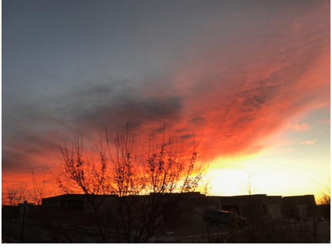
Pink Sky