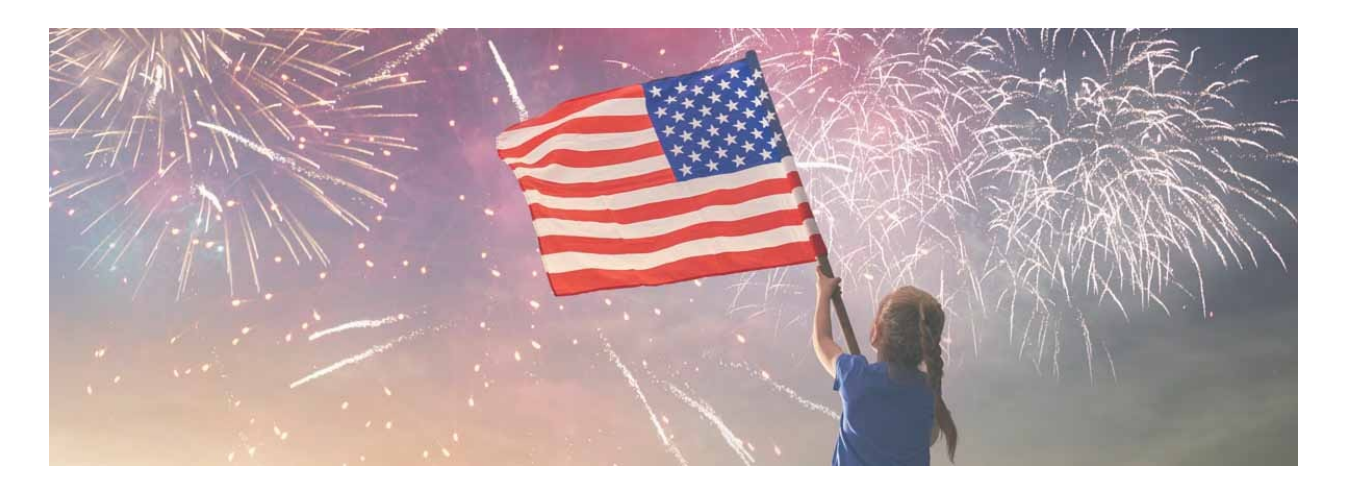
Come join us for our 4<sup>th</sup> of July neighborhood event! Monday, July 4, 2022 11am – 2pm La Entrada Park at Via Sagrada and Via Punto Nuevo