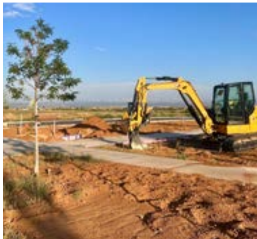
Progress is being made on the new Mountain Vista Park