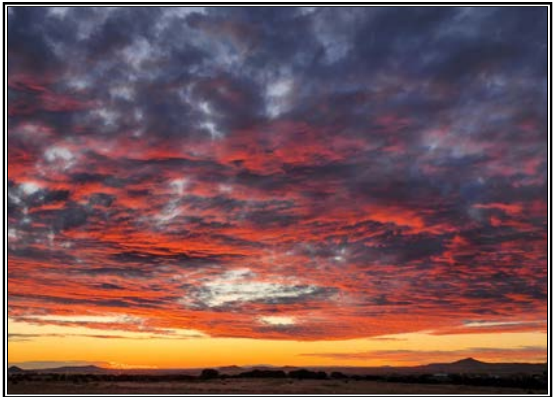
The winning photo of the 2025 La Entrada Sunset Photo Contest.