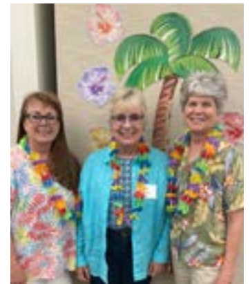
Ladies at the summer luau, June 11, 2025